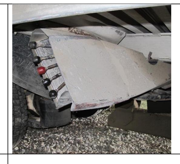
Paint transfer from the Suzuki.